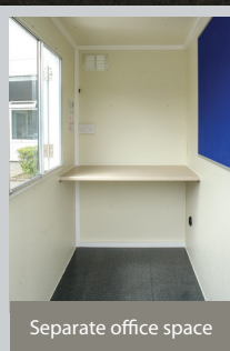
Separate office space