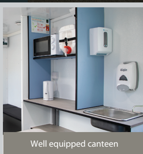
Well equipped canteen