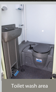
Toilet wash area