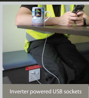
Inverter powered USB sockets